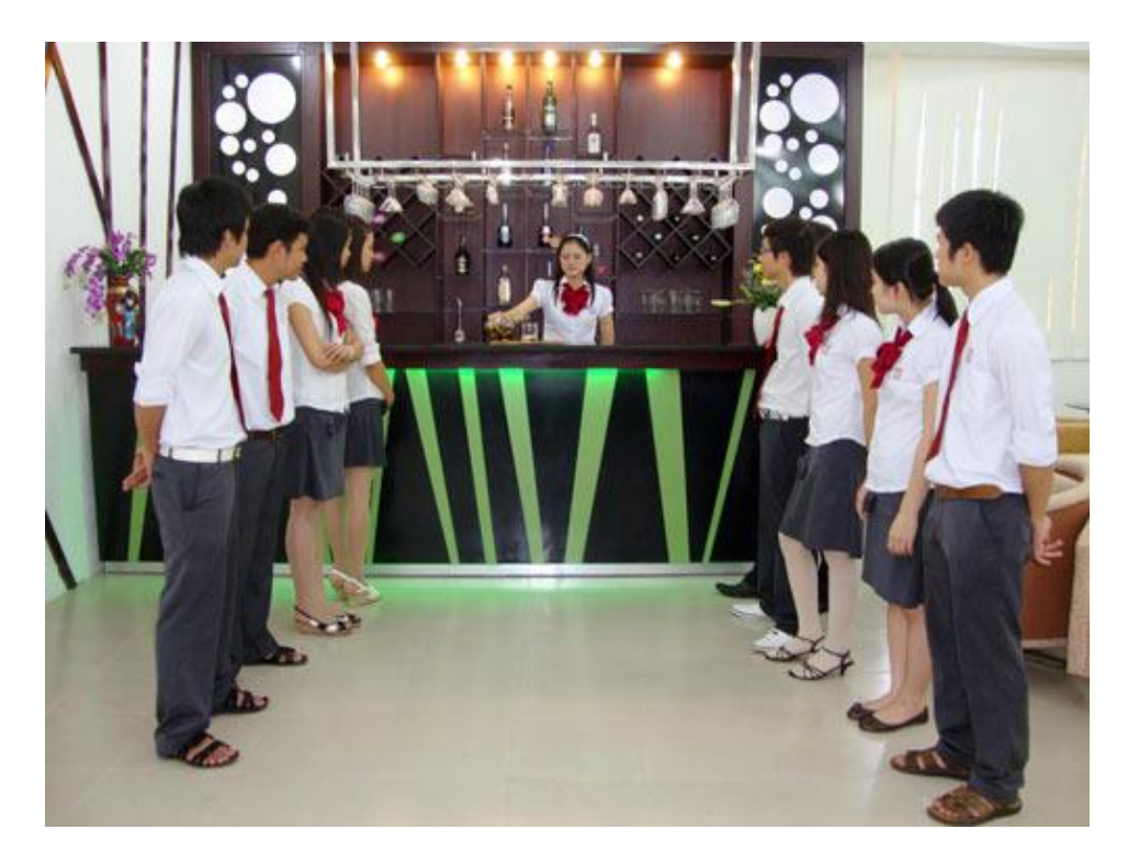
DTU students in a practice lesson

On the 19<sup>th</sup> of September 19, 2011, DTU was granted permission by MOET to open a Vocational College specializing in Information Technology, Accounting and Tourism & Hospitality. One month later, DTU became the only institution to offer courses running from the vocational to undergraduate levels.