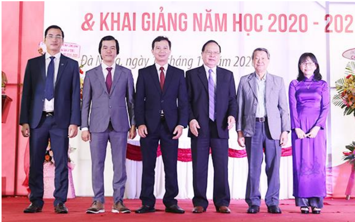
DTU introduces its five new schools