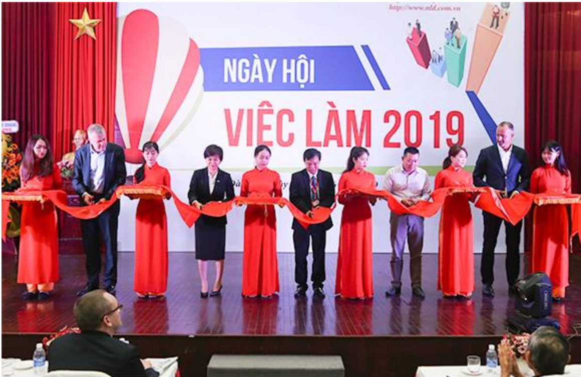
DTU partners with the Nguoi Lao Dong newspaper

Since 2006, DTU and the Nguoi Lao Dong newspaper have organized a Jobs Fair, a dependable annual event that provides golden opportunities for upcoming graduates.