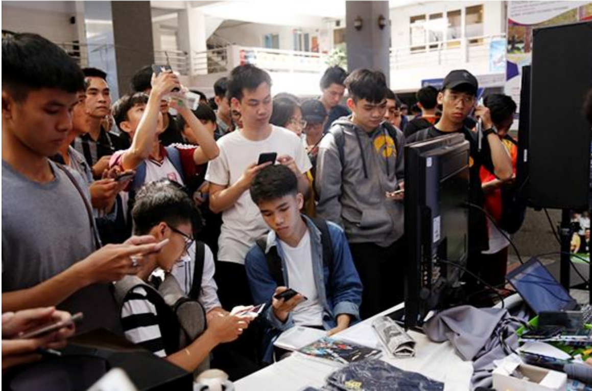
The DTU Jobs Fair attracts job hunters