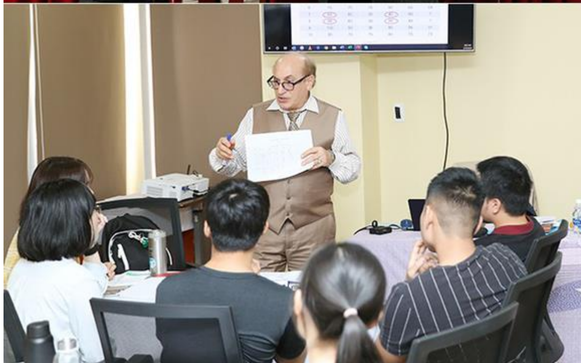
DTU partners with American universities in medical studies