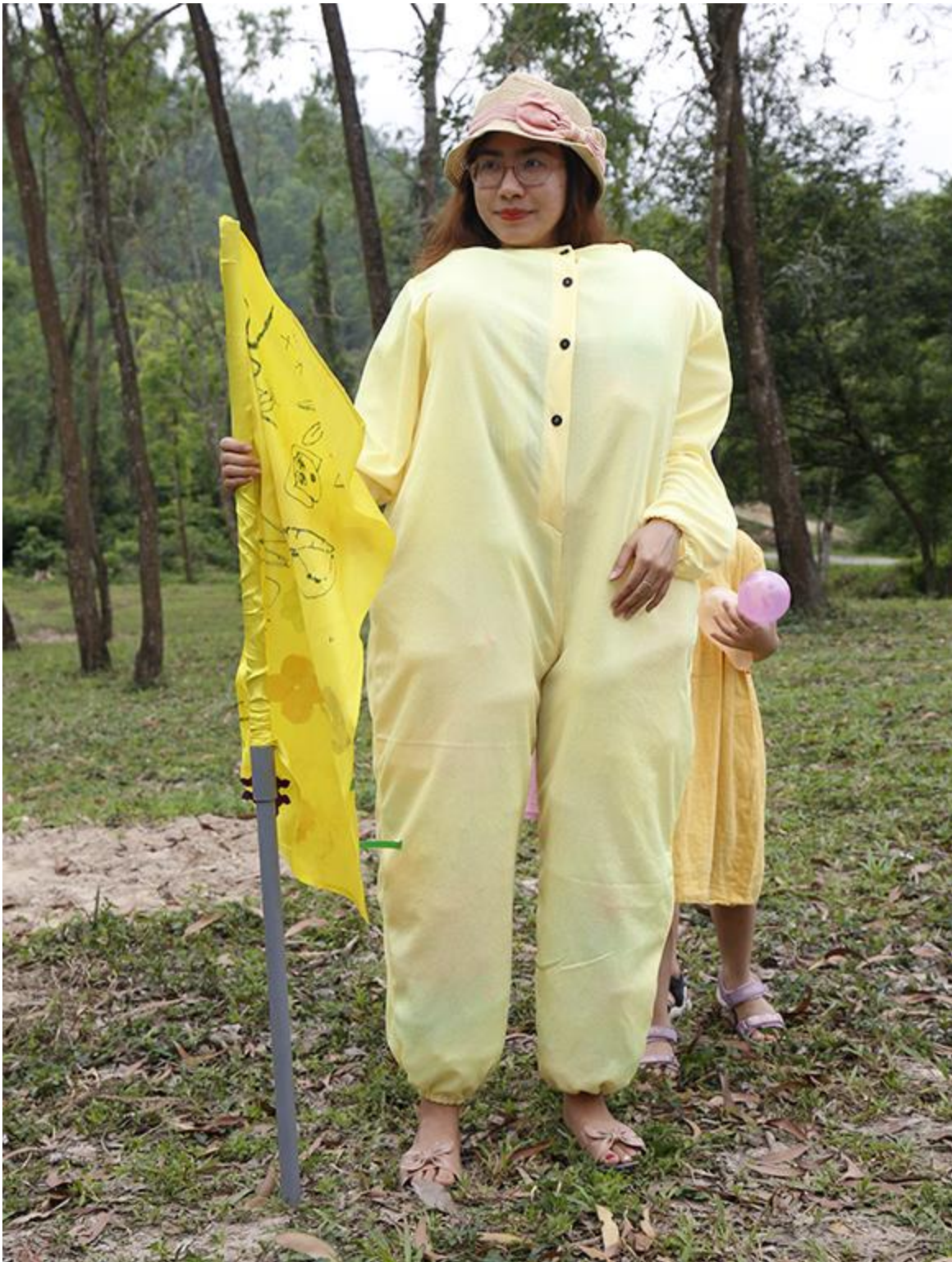
Attractive muscles of the team Yellow strongwoman