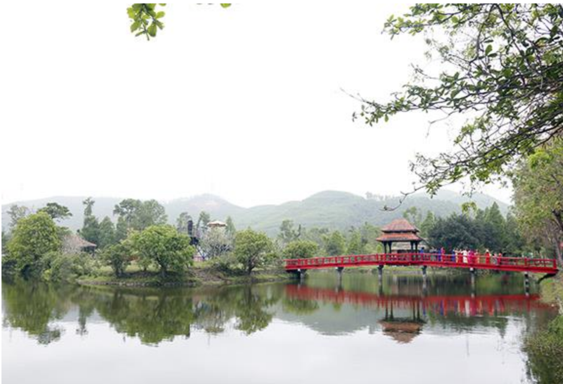
The Alba Thanh Tan Hot Springs