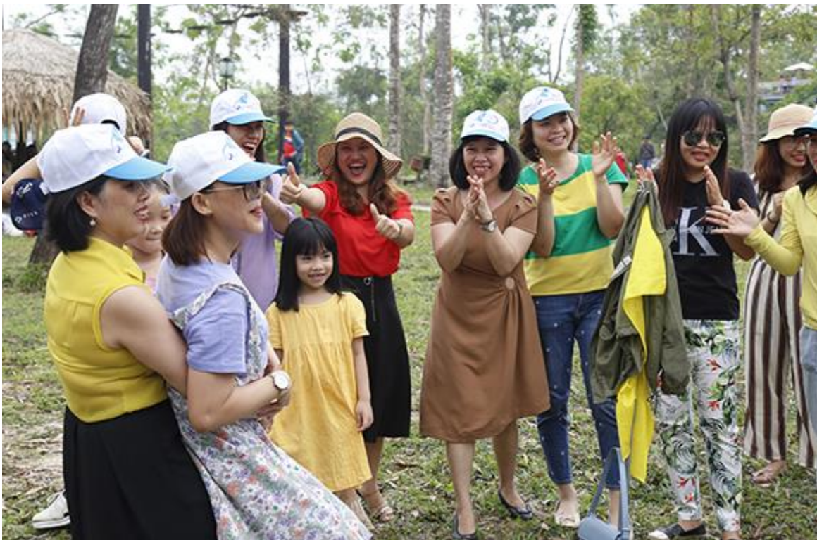
“Who is the Toughest?”, deputy team-captains carry their captain and the strongest team wins