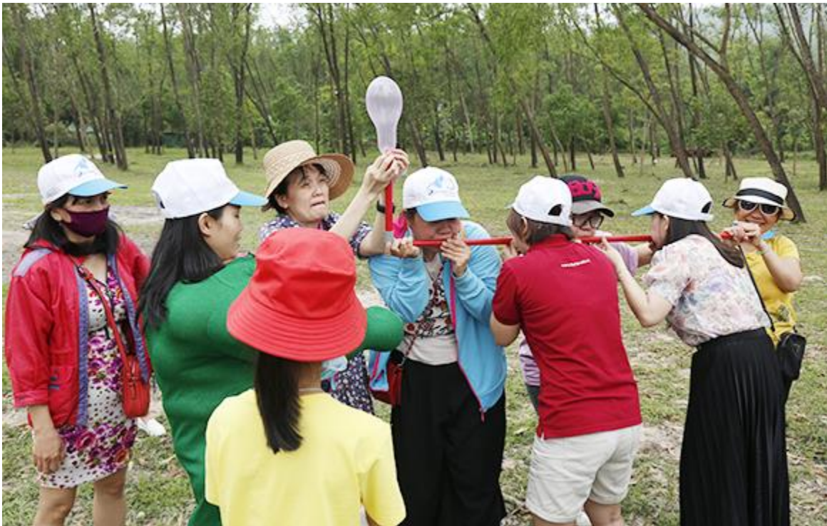
“Matching”, teams work together to break a ball at the end of a stick, the first team to break 10 wins.