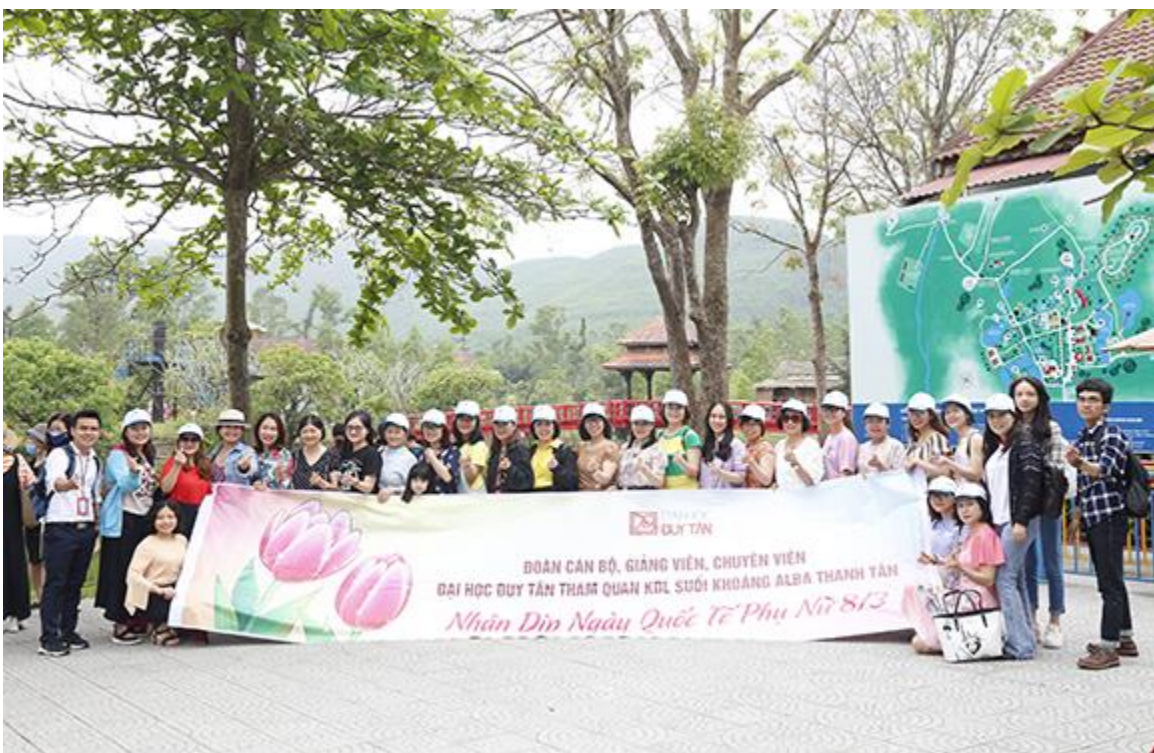
Women DTU staff, lecturers and employees visit the springs