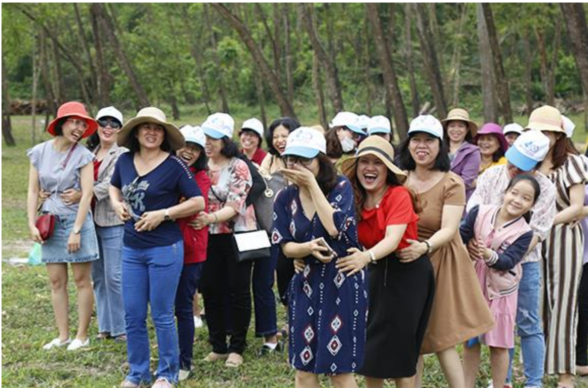
Teambuilding and other activities, with three teams