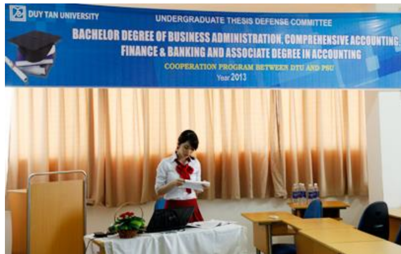
A DTU student from the PSU program presents her graduation thesis

The undergraduate thesis defense committee included lecturers from the CMU and PSU programs and CEOs of local software companies, banks and others. During the presentations, students of Information Technology (CMU), Information Systems (CMU), Business Administration (PSU), Finance and Banking (PSU) and Auditing (PSU) defended their theses in English, fluently and confidently. They gave good answers to many questions raised by the committee.