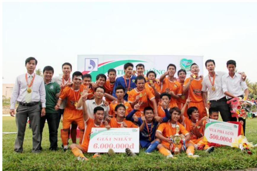
DTU, New Champions of the Huda Cup Football Tournament

We feel very proud of those achievements because DTU is only a private university but the outstanding academic training and direction has helped these students to succeed. By combining their studies and team-play, instead of just focusing on their class-work, students will strive to perform better and better.