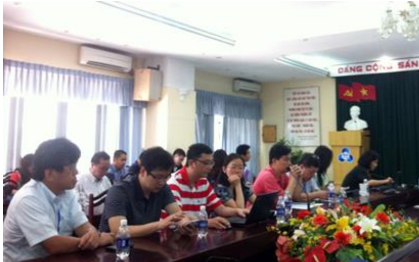
Delegates admitting new members of the CDIO Association

DTU was the second institution and the only private university in Vietnam to become a member in 2012. DTU has now applied the CDIO model to engineering education.