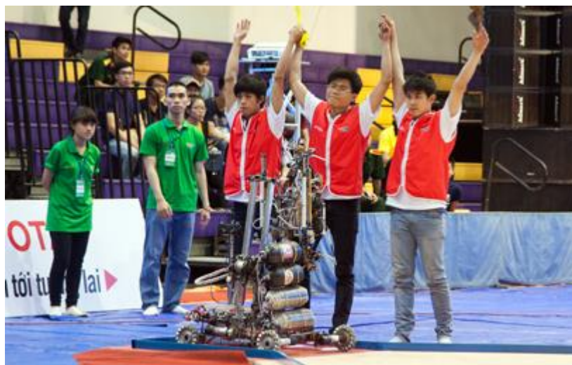
The DTU team performs at Robocon 2014

The Central and Highland Region Qualifying round of the Vietnam Robot Contest (Robocon) 2014 was held from April the 3rd to 5th at the Physical Education Center of the Danang University of Technology. Spectators had the opportunity to witness many thrilling performances and spectacular wins on the first day. Initiated by India, host of the 2014 Asia-Pacific Robot Contest 2014 (ABU Robocon), the theme “A Salute to the Parenthood” sings the praises of the love of parents for their children.