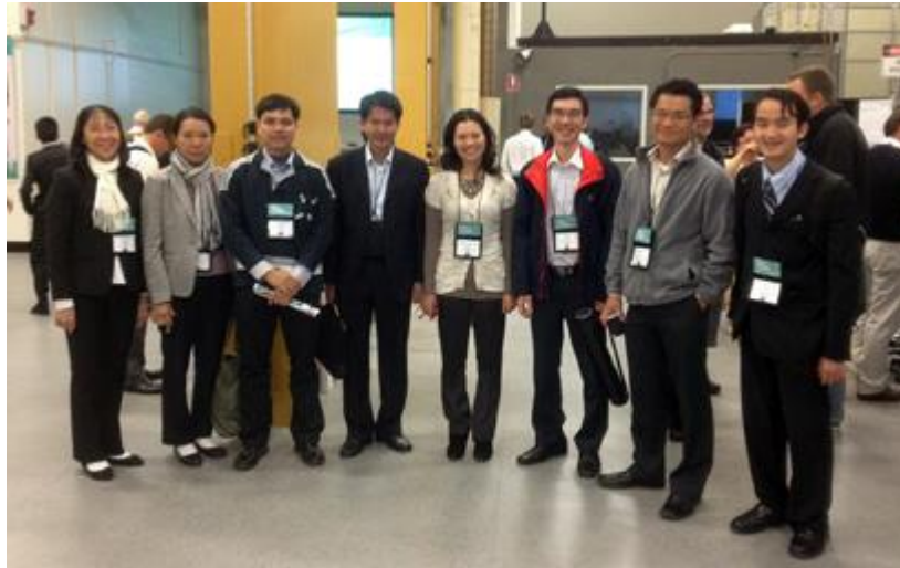
Members of Ho Chi Minh National University and DTU at Queensland University of Technology

teaching methods, expanding collaboration with foreign universities and colleges, and so on. Eighty-nine percent of DTU students find jobs on graduation and most impress their companies with abilities.