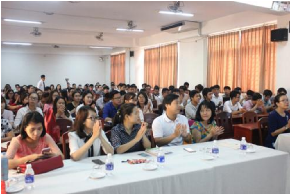
The leaders of the International School, lecturers and students

On May 6, the International School awarded Course Completion Certificates for students in the advanced CMU, PSU, and CSU programs, and also Japanese IT Passports to IT students.