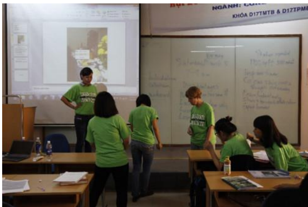
Foreign lecturers teach courses in software production