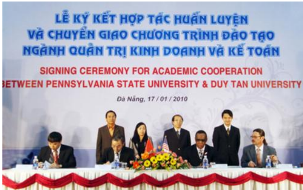
Signing the agreement with Pennsylvania State University

In 2011, DTU signed an agreement with California State University, one of the leading universities on the US West Coast, to share advanced curricula in Architecture and Construction. Under the agreements, the three partnership programs provide DTU with 18 to 24 major and minor courses each.