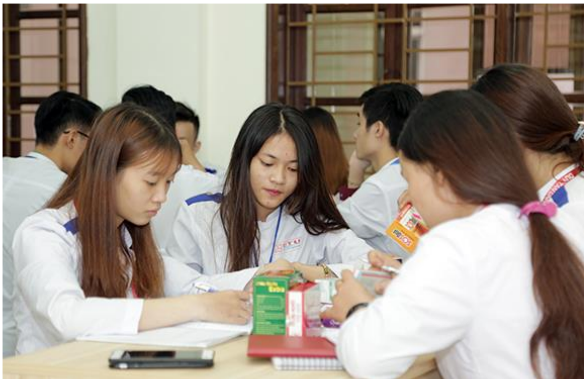
Students train at the DTU Pharmacy

DTU partners with several major American universities to share programs, including the University of Illinois in Chicago, which has the most comprehensive program in Medicine and Nursing in the US, and the University of Pittsburgh, ranked seventh in the US in Health Sciences, and the Duke-NUS Medical School in Singapore.